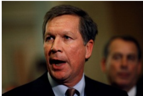
Ohio Governor John Kasich